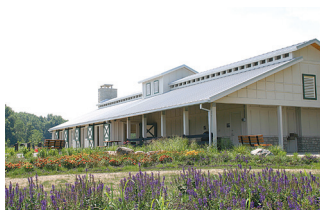
HANNAH PARK SHELTER & PATIO*

10 a.m. - 2 p.m. or 4 p.m. - 8 p.m. (See Restrictions Below)