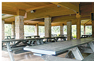
FRIENDSHIP PARK SHELTER*

10 a.m. - 2 p.m. or 4 p.m. - 8 p.m. (See Restrictions Below)