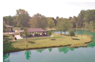
WOODSIDE GREEN SHELTER*

10 a.m. - 2 p.m. or 4 p.m. - 8 p.m. (See Restrictions Below)