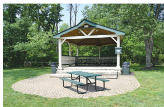
FRIENDSHIP PARK GAZEBO*

10 a.m. - 2 p.m. or 4 p.m. - 8 p.m. (See Restrictions Below)