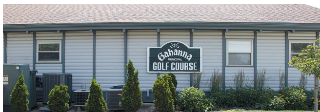
GOLF COURSE CLUBHOUSE