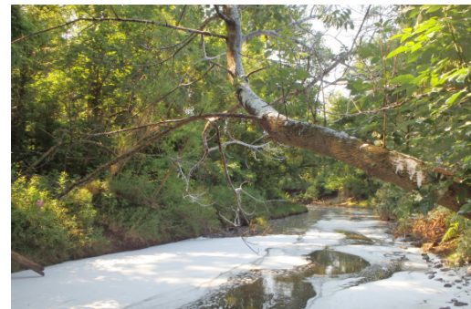
Stream full of suds from stormwater system

Know what qualifies as hazardous waste and make arrangements for its proper disposal. Ohio EPA's Division of Hazardous Waste Management can be reached at (614) 644-2934.