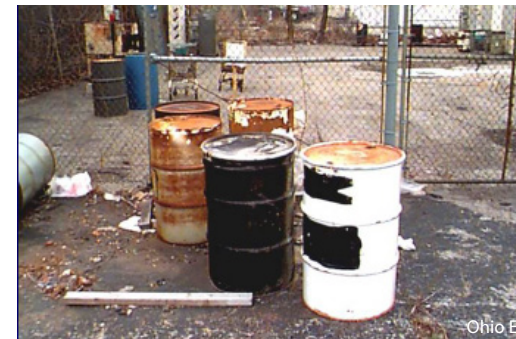
Improper outdoor storage—no secondary containment

Power washing water must be contained and disposed of either to a sanitary sewer, possibly after pre-treatment, or as hazardous waste. Before hiring a contractor, know what he or she does with wastewater.