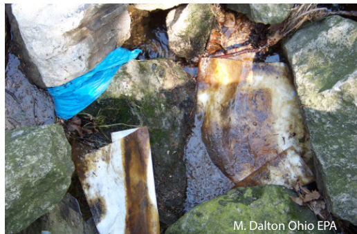
Pads used to absorb cooking oil that entered a stream from improper filter cleaning

Work done outside must be on a hard surface (not soil or gravel) with a drain to pre-treatment and a sanitary sewer system or another containment and collection system.