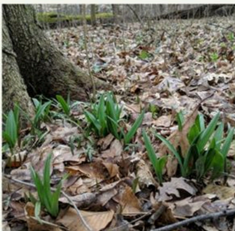
Ramps (Wild Onion)